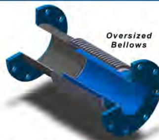
"Full Flow Design"

T-321 STAINLESS STEEL BELLOWS FULL FLOW LINER WITH MAXIMUM LATERAL OFFSET CAPABILITY 125/150# ANSI FLANGE INLET, A-36 STEEL 125/150# ANSI FLANGE OUTLET, A-36 STEEL TUBE SPACER, CARBON STEEL